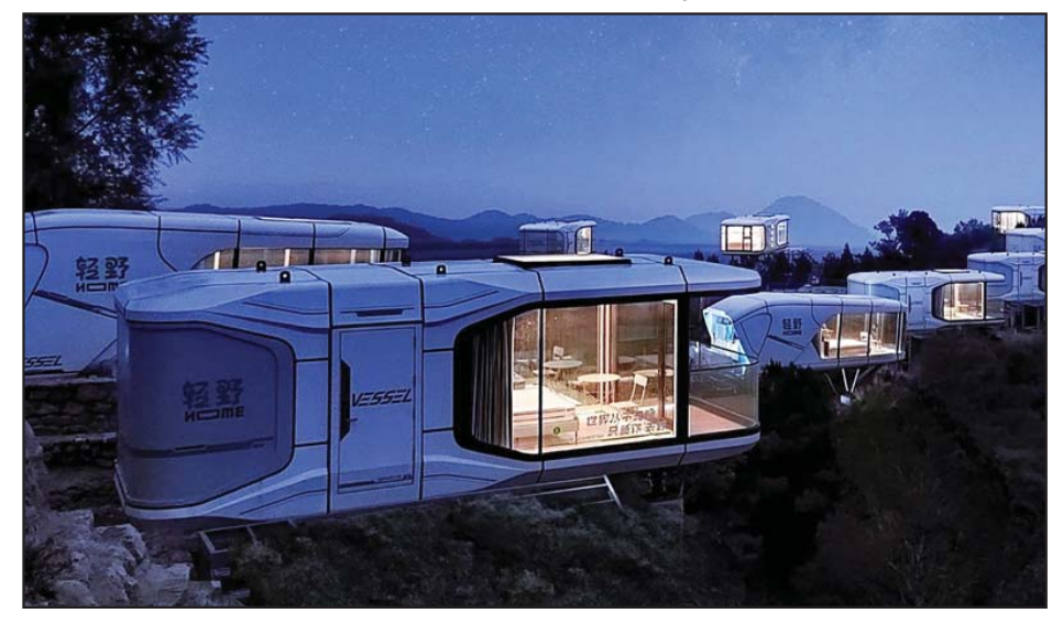
Guangdon VESSEL of China decided to focus on affordable housing rather than luxury as it learned about the US market and unprecedented homelessness.

cance of this issue and the unique opportunity for international collaboration. By partnering with like-minded individuals, organizations, and governments, we aim to create a collective force capable of addressing the multifaceted challenge of homelessness